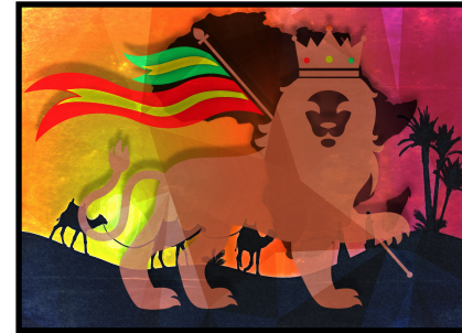
Israel Callejas, 12th grade