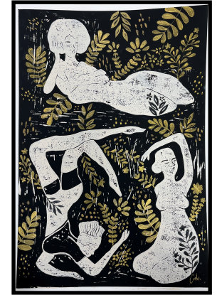
Kelly Orozco, 11th grade